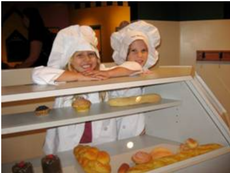
Young bakers enjoy "The Market" exhibit at the Greensboro Children's Museum.